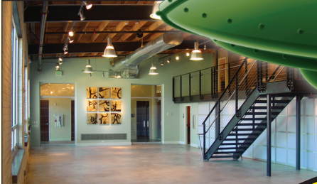
Interior of Zen